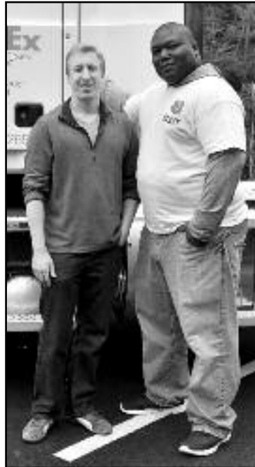
Photos from this and other events can be found online at rennamedia.com and on the New Providence News page on facebook.com Feel free to "Like", "Tag" and "Share".