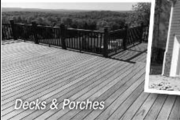
Decks & Porches