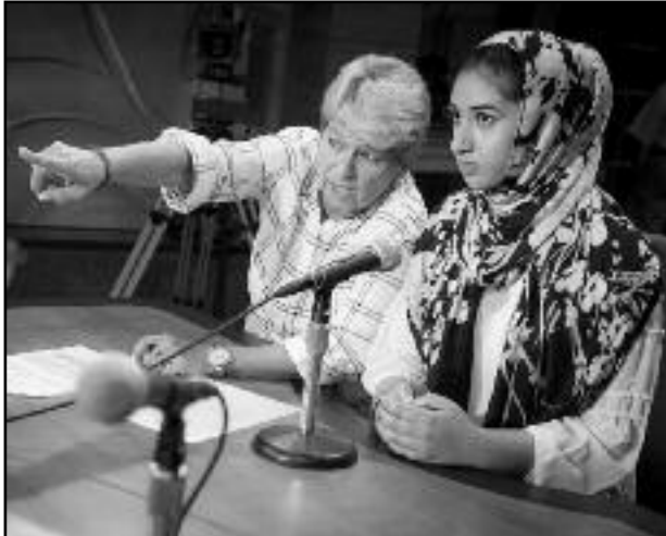
(above) Career Day Newsmakers