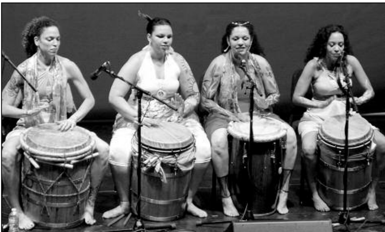
(above) The Legacy Women, an all-women drum, song and dance troupe that plays the fire-igniting sounds Afro-Caribbean Bomba music who will be performing at the Township of Union's Hispanic Heritage Month Celebration on October 12th.