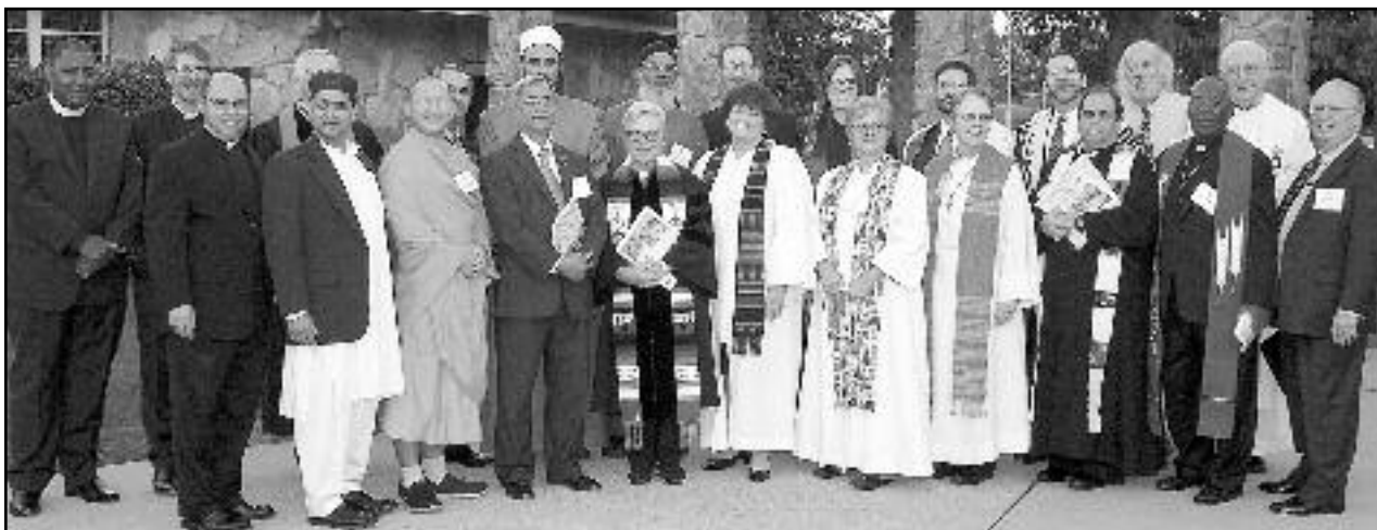
(above) Members of the Union County Interfaith Coordinating Council and other invited speakers at the Third Annual Union County Day of Prayer.