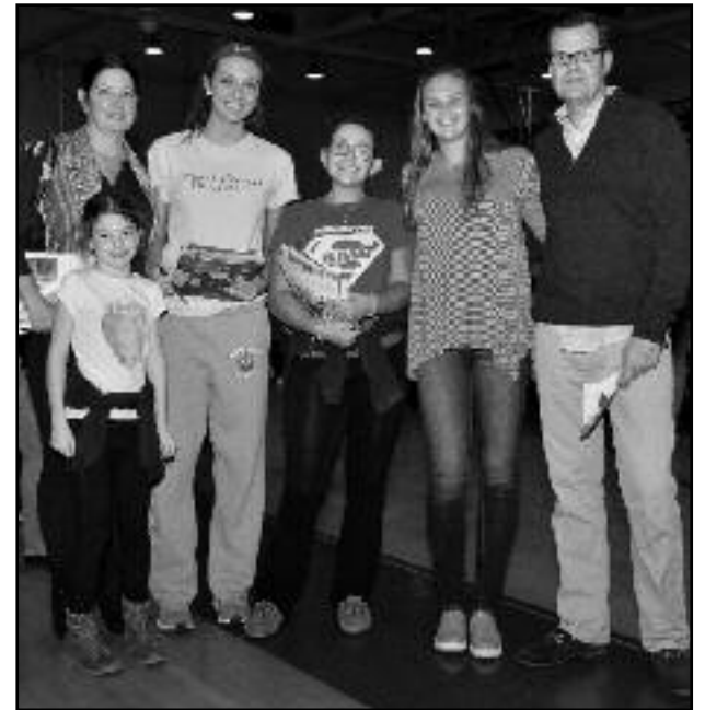
Photos from this and other events can be found online at rennamedia.com and on the Berkeley Heights News page on facebook.com Feel free to "Like", "Tag" and "Share"

The college fair began at 7 p.m., from the moment the doors opened, floods of students poured into the school's gyms, where a sea of higher institutions were lined up, ready to welcome their next batch of students. Parents and children roamed the gyms bouncing from table to table, gathering more paperwork with information than they could hold.