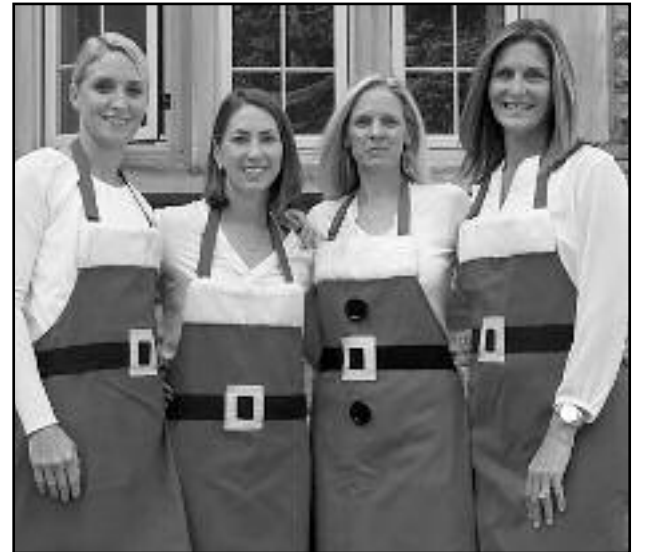
(above) Santa Claus Shop helpers.

To keep the holiday spirit alive for those in the community, the Santa Claus Shop chairwomen ask for checks to be made payable to SHIP, with Santa Claus Shop noted on the check's memo line, and mailed to the Santa Claus Shop, P.O. Box 119, Summit, NJ 07901. The ability to make an online donation is also available at www.summitsantaclausshop.com If you would like to find out more information or get involved please visit our website or follow us on Facebook at Santa Claus Shop - Summit, NJ.