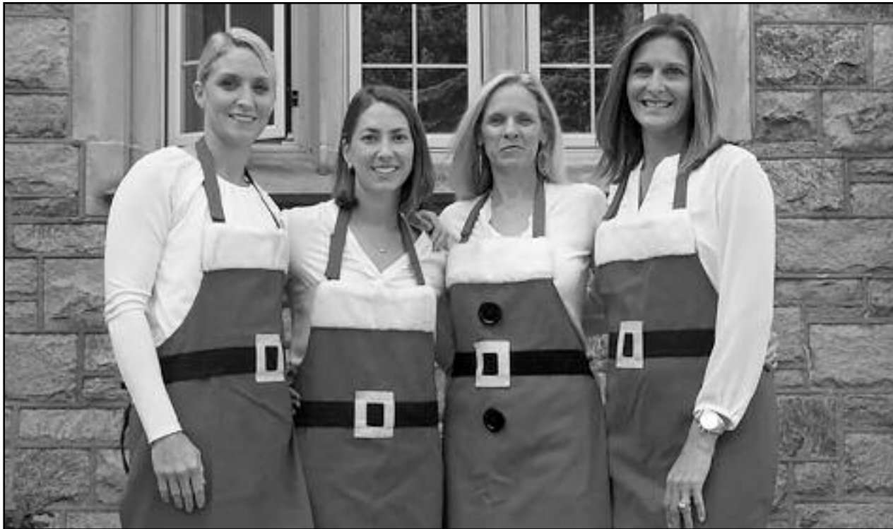
(above) Santa Claus Shop helpers.

To keep the holiday spirit alive for those in the community, the Santa Claus Shop chairwomen ask for checks to be made payable to SHIP, with Santa Claus Shop noted on the check's memo line, and mailed to the Santa Claus Shop, P.O. Box 119, Summit, NJ 07901. The ability to make an online donation is also available at www.summitsantaclausshop.com . If you would like to find out more information or get involved please visit our website or follow us on Facebook at Santa Claus Shop - Summit, NJ.