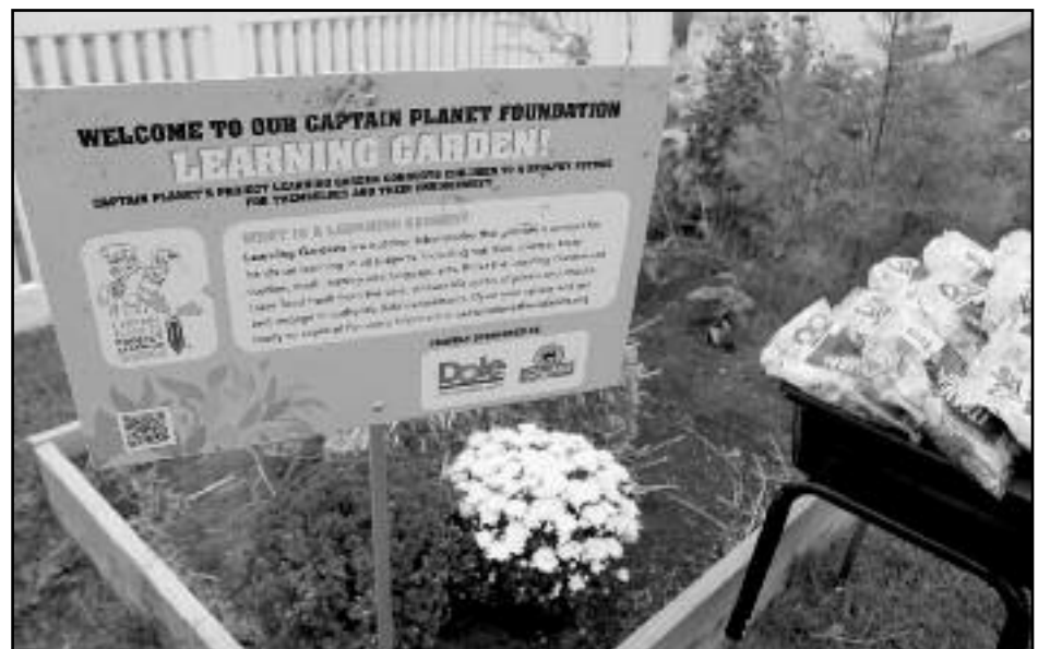
(above) One of the planting beds at the Project Learning Garden at Battle Hill Elementary School in Union. ShopRite, Dole Packaged Goods and the Captain Planet Foundation collaborated to offer students the special garden and curriculum.