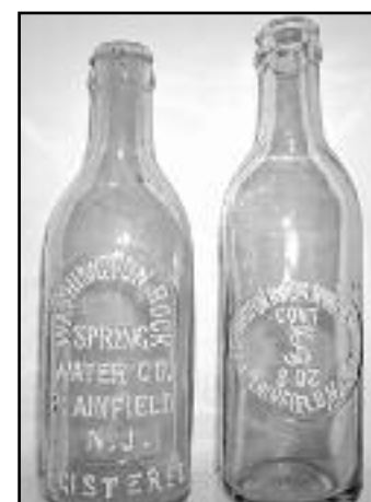
(above) Washington Rock Spring Water Bottles

For more information about the Green Brook Historical Society, visit