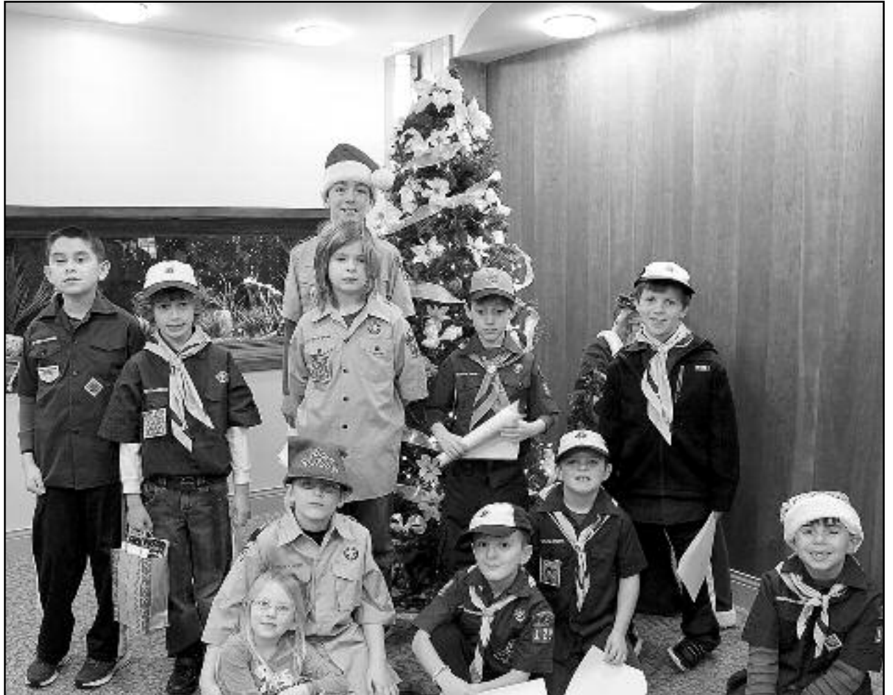
(above) Members of Pack 129 at Eastern Star Home.

Cub Scouts Pack 129, based in Green Brook, is open to all grades K through 5th. For information about Pack 129 you may contact Brent Cheshire at info@greenbrookpack129.org .