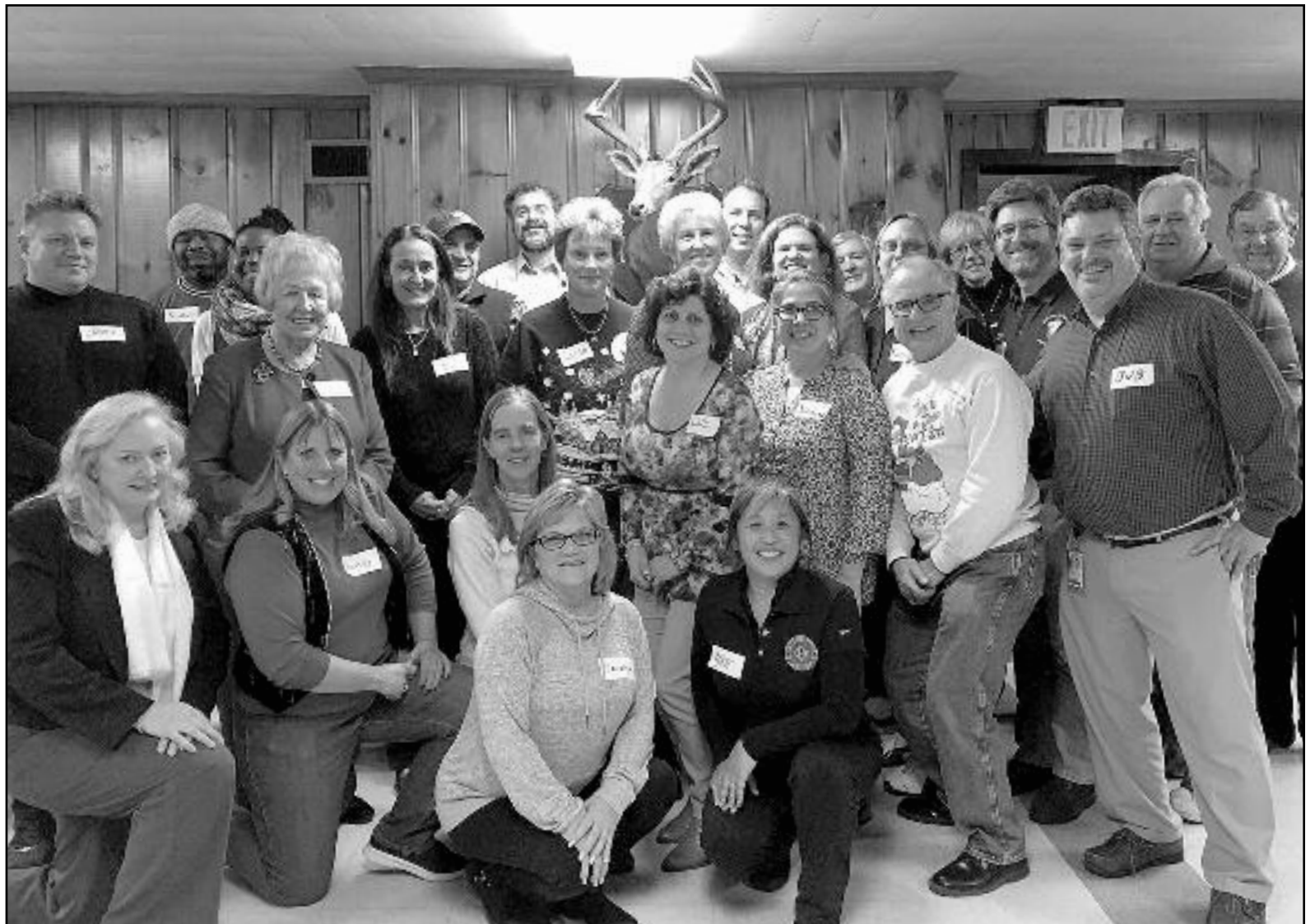
(above) Warren, Watchung and Green Brook CERT teams recently gathered together to celebrate the holidays.

Community Emergency Response Team (CERT), assists our local first responders in cases of emergencies. We might be called for various tasks such as traffic assistance, sheltering or search & rescue.