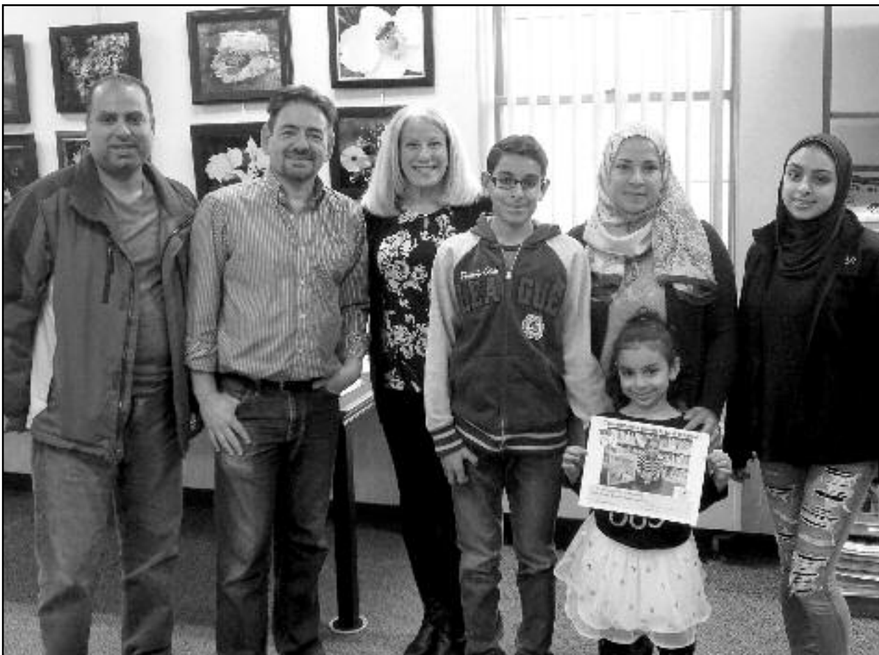
(above) Children who have completed the Kindergarten program received their certificates of achievement.

For more information, call the library at 908-276-2451 or visit 548 Boulevard.