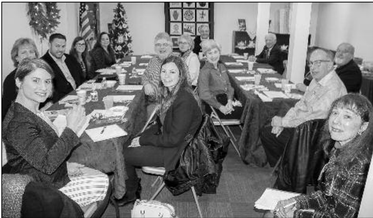
(above) The December meeting attendees of the Kenilworth Chamber of Commerce. For more information about the Chamber please call 908-352-0900.

(pictured) The December meeting attendees of the Kenilworth Chamber of Commerce. For more information about the Chamber please call 908-352-0900.