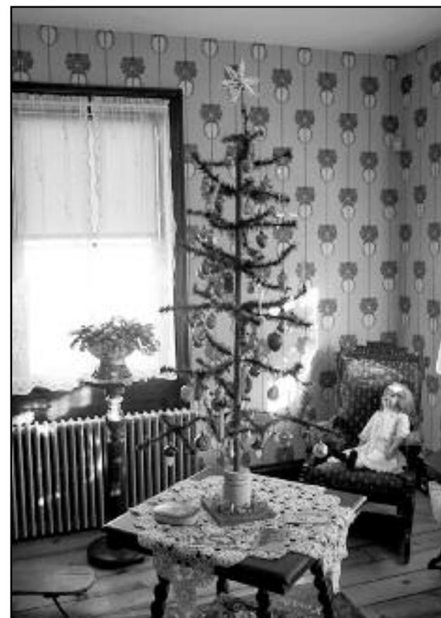
Photos from this and other events can be found online at rennamedia.com and on the Kenilworth Life page on facebook.com . Feel free to "Like", "Tag" and "Share"