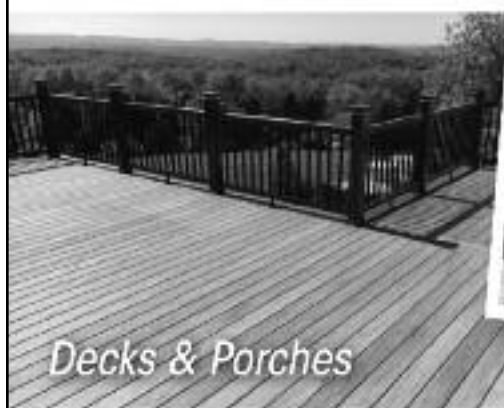
Decks & Porches