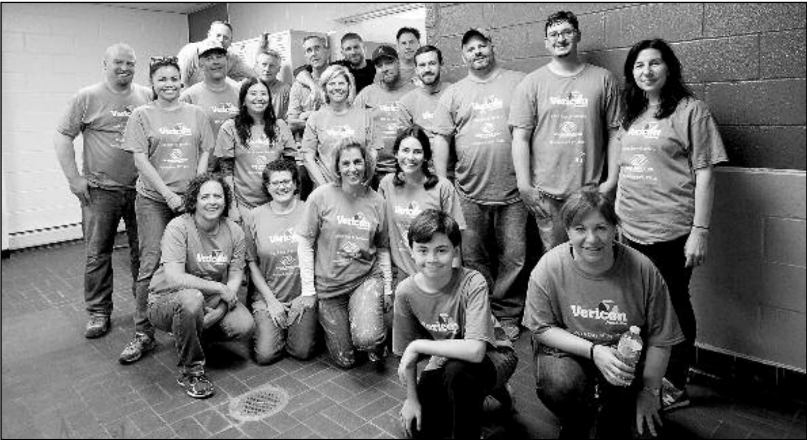
(above) Vericon Construction employees spent a Saturday on the renovation project at BGCUC Union Club.

Officer, “The Vericon Foundation is so happy to be able to provide locker room renovations at the Boys & Girls Clubs of Union County. It is such a worthy organization and we hope that the results of our efforts are enjoyed by the many kids who use this facility.” Boys & Girls Clubs of Union County offers youth programs in 5 communities in Union County: Plainfield, Elizabeth, Union, Hillside and Roselle. Teen leadership programs for ages 14-18 are available in Union, Elizabeth and Plainfield. Members participate in character, leadership, career preparation and community service activities throughout the year. Aquatics instruction is available at our Union Club. After School Program Registration is open. For information on our clubs and programs, please visit our website www.bgcuc.org or contact us 908-687-2697. About Vericon Foundation: Established in the Spring of 2015 as a way to commemorate Vericon Construction Company’s 10-year anniversary, the Vericon Foundation is a non-profit organization focused on giving back to the communities in which we work. Each year, Vericon Construction Company contributes a portion of its profits to help grow and sustain the Foundation’s efforts of raising awareness and funds for local charitable causes.