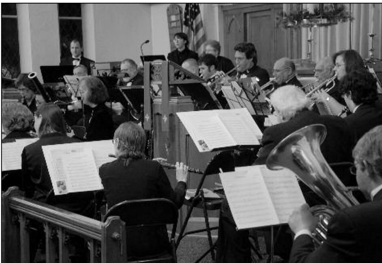
(above) On Thursday, January 12, 2017, the NJWA Majestic Winds will perform a benefit concert for the mission work at the First Baptist Church in Westfield.

For additional information about NJWA or Majestic Winds, call 908-789-9696 or email njwaband@att.net .