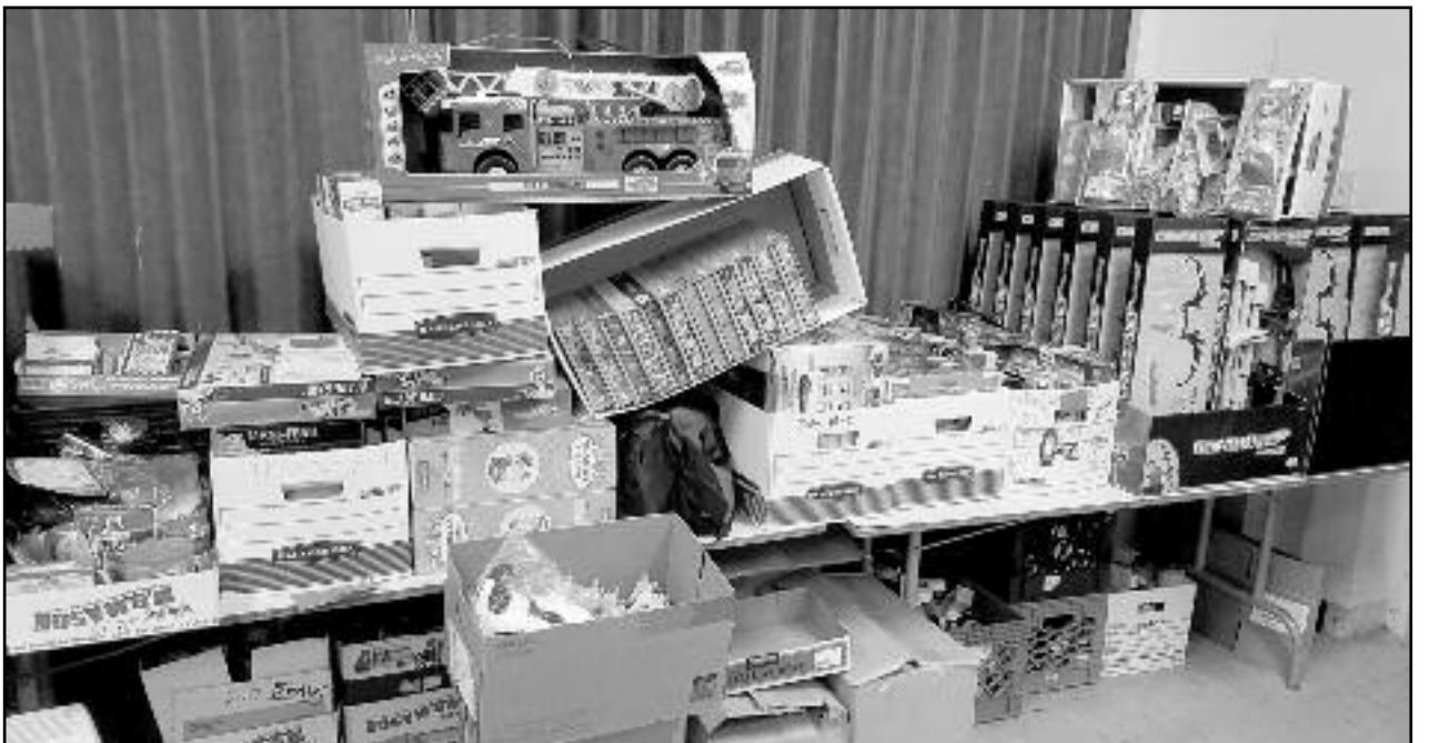
(above) Toys of all types were donated by VIP Honda of North Plainfield await children whose families will also receive Christmas dinners, courtesy of Star Fish Food Pantry.