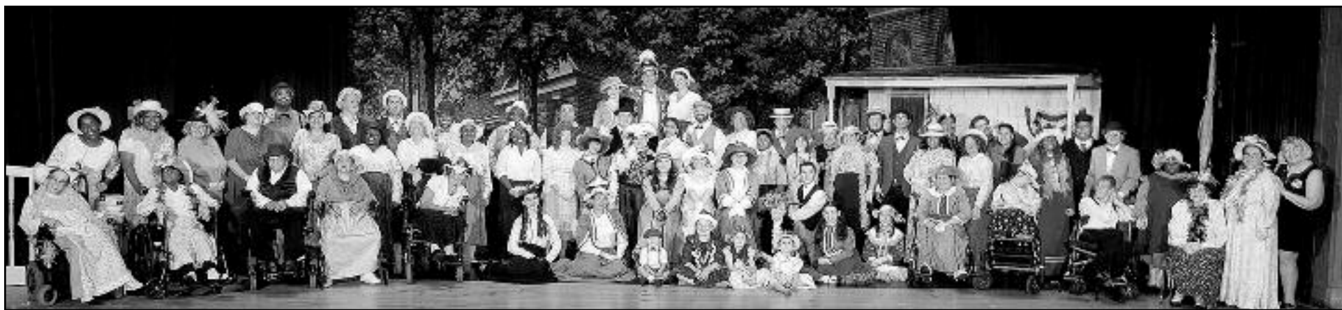
(above) The cast of last year's production, "Music Man, Jr."

Audition schedule: Tuesday, Jan. 17 – 6:30-8:00 p.m.; Thursday, Jan. 19 – 6:30-8:00 p.m. ; Saturday, Jan. 21 – 10:00 a.m.-12:00 p.m.