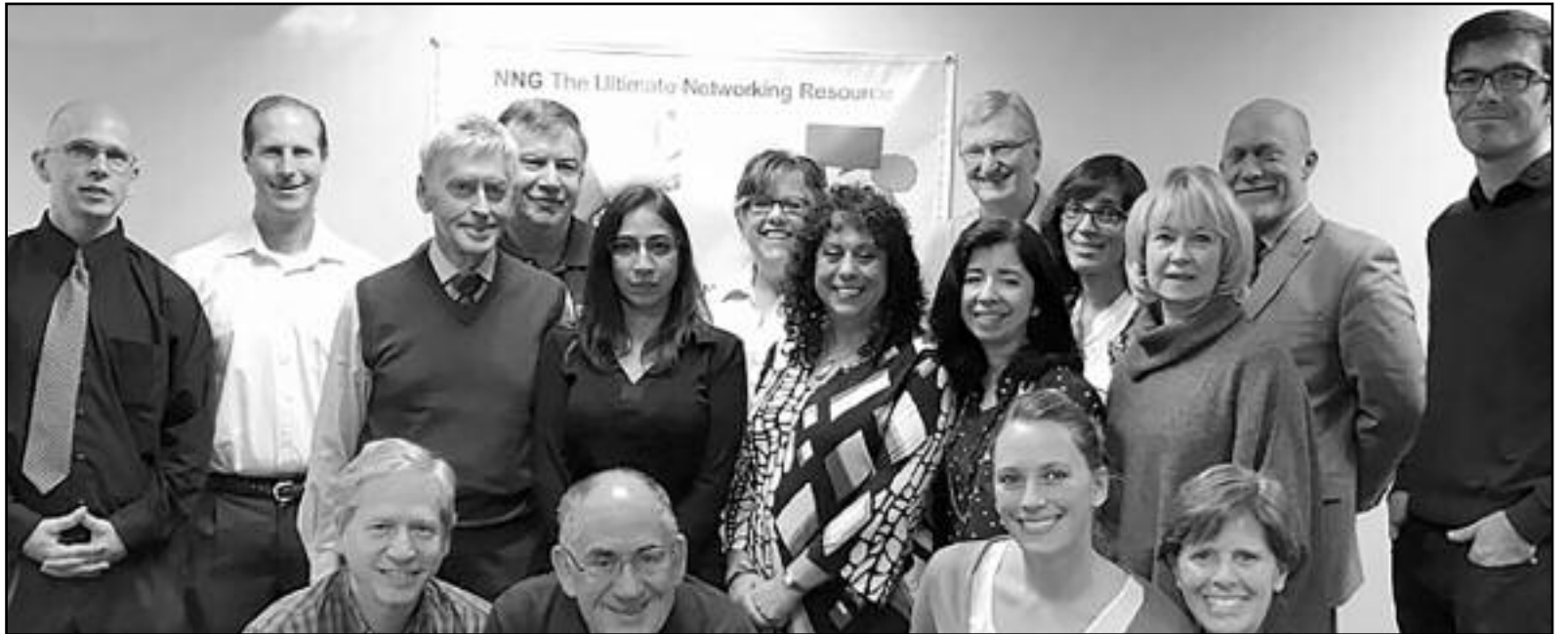
(above) The Neighborhood Networking Group meets on the 2nd and 4th Friday of the month, 7:30 am – 9 am, at Connell Business Center, 100 Connell Drive, Berkeley Heights, NJ.

The Neighborhood Networking Group (NNG) was founded in 2004. NNG started with 6 leading business owners, and has grown to 30 professionals with a mission to provide outstanding service to the community, and support each other in growing their businesses.