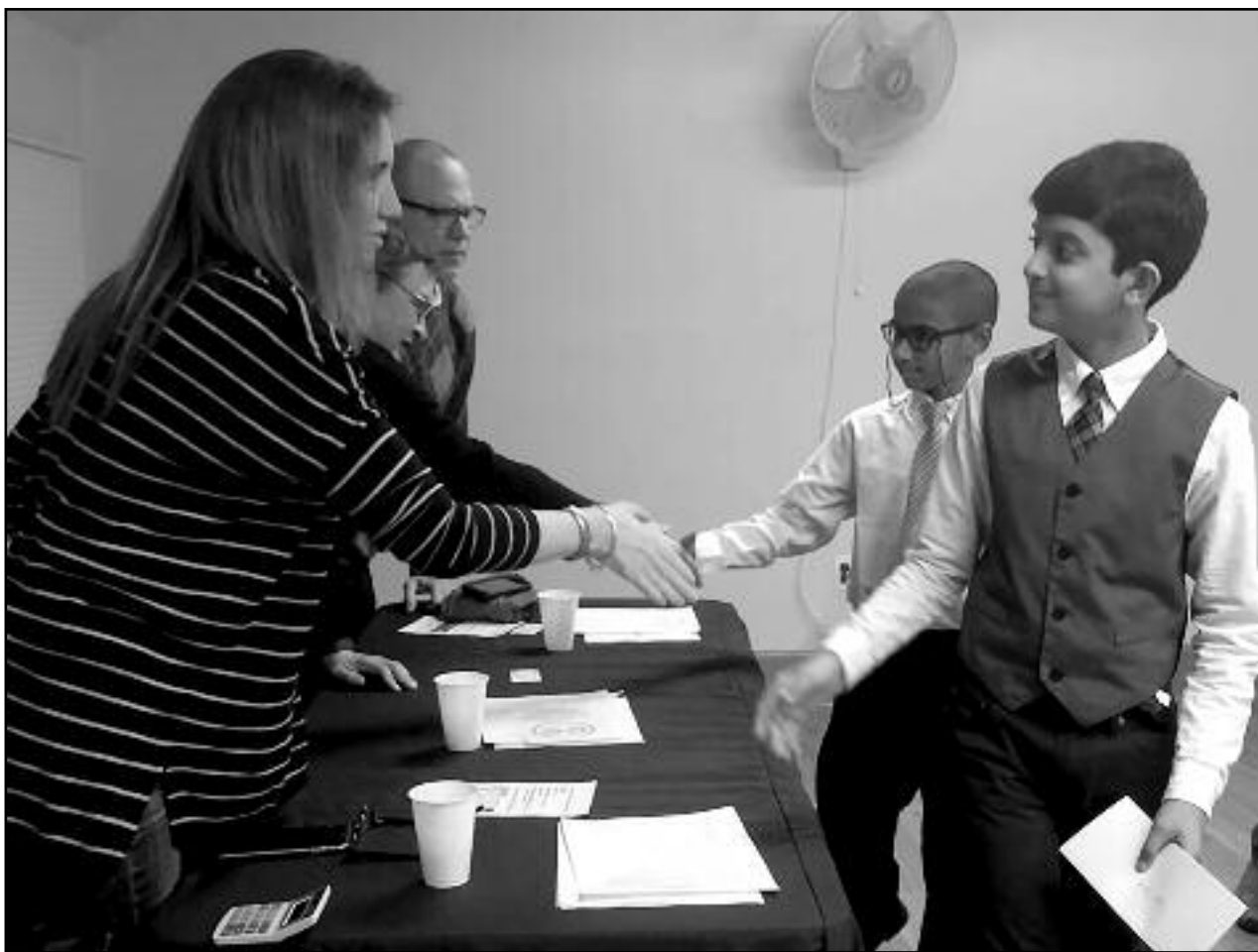
(above) Shark Tank panelists congratulating middle school winners