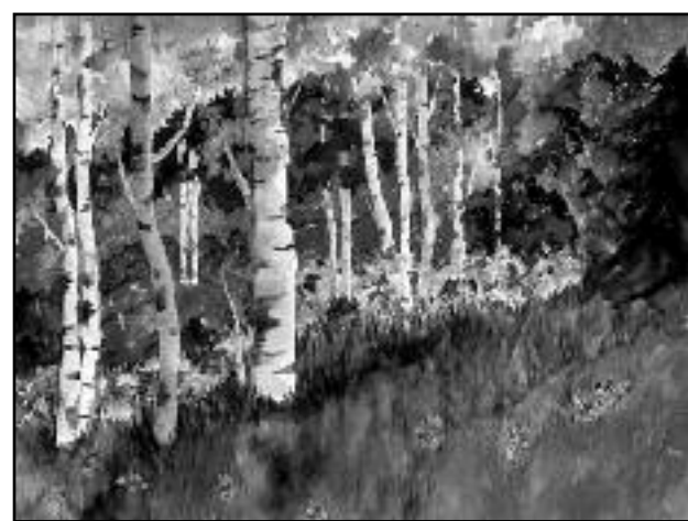
(above) Lisa Brown: Coming into the Woods

Stirling Road in Watchung on the Watchung Circle, is a multi-disciplinary arts facility serving Watchung, the surrounding communities and the Tri-State Area. The Gallery is open Tues.-Fri. noon-5pm and Sat. 10:00am-3:00pm. To obtain more information about upcoming performances, classes and workshops, and monthly art exhibitions, please visit WatchungArts.org or call 908-753-0190.