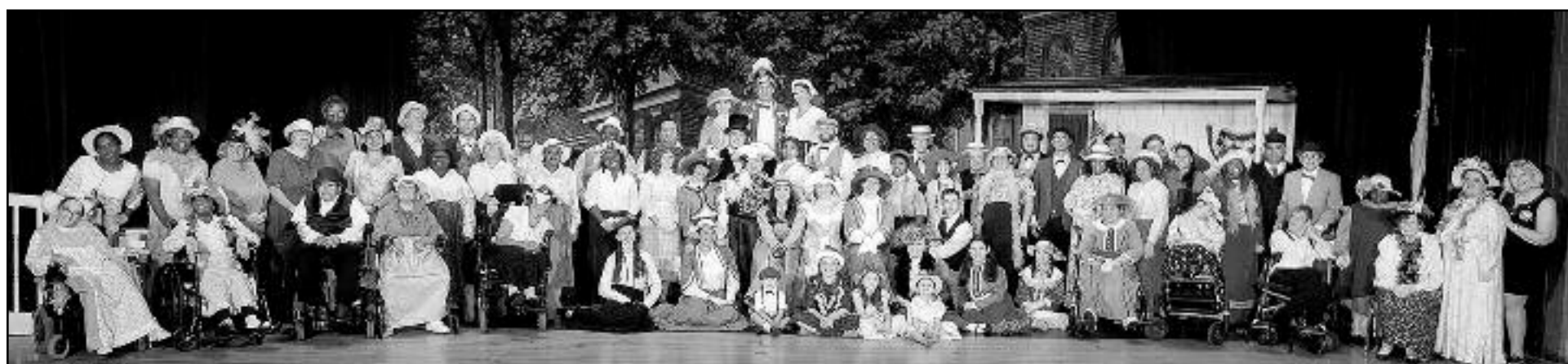
(above) The cast of last year's production, "Music Man, Jr."

Audition schedule: Tuesday, Jan. 17 – 6:30-8:00 p.m.; Thursday, Jan. 19 – 6:30-8:00 p.m. ; Saturday, Jan. 21 – 10:00 a.m.-12:00 p.m.