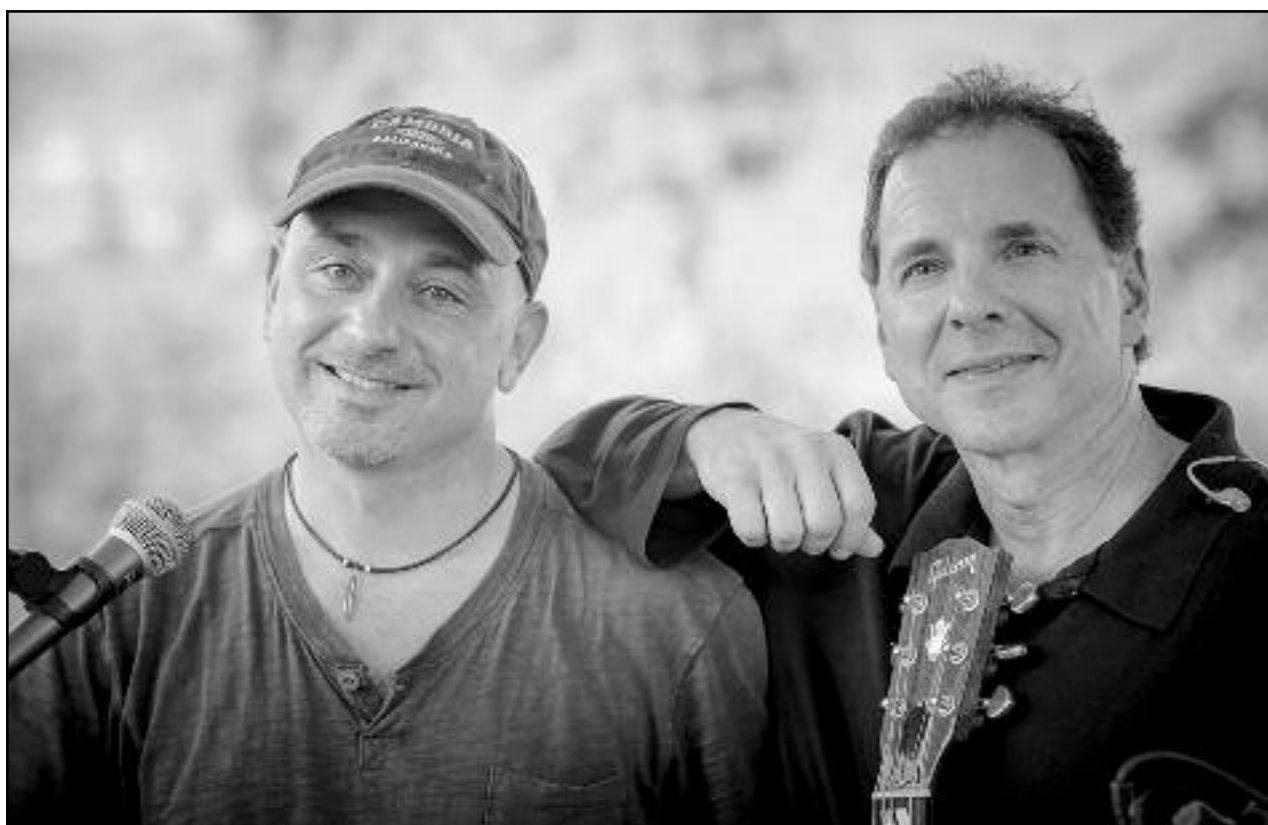
(above) Acoustic Road will perform on Saturday, January 21, 2017, 8 PM.

The Watchung Arts Center, located at 18 Stirling Road in Watchung on the Watchung Circle, is a multi-disciplinary arts facility serving Watchung, the surrounding communities and the Tri-State Area. To obtain more information about upcoming performances, classes and workshops, and monthly art exhibitions, please visit WatchungArts.org or call 908-753-0190.