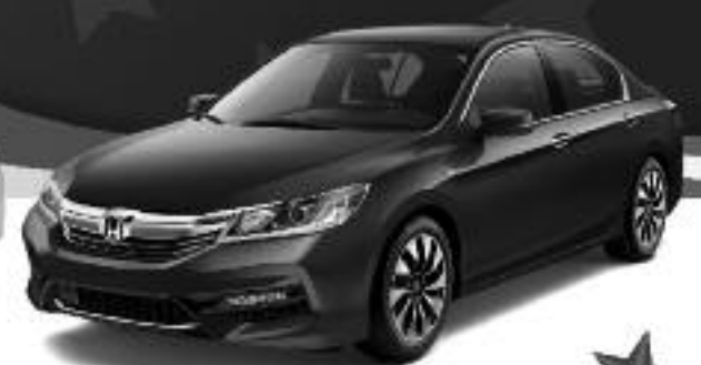
★ NEW 2017 Honda Accord Hybrid

Auto, 4 cyl, p/opts. Stk#170518 MSRP:$23,155. $1,699 due at signing. $0 security. Residual: $14,633.90. 10k mi/yr; 15¢ thereafter. $995 Cap Cost Reduction. *$500 Military Appreciation Offer. *$500 College Graduate Offer.