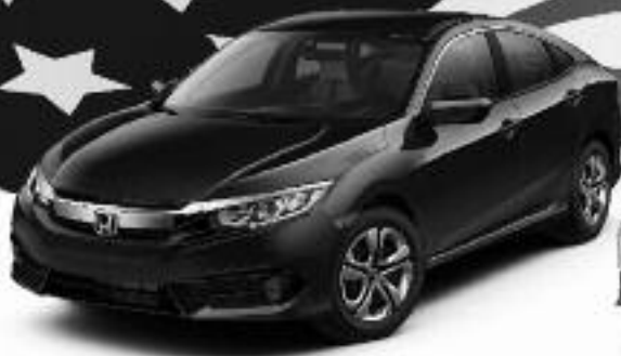
★ NEW 2017 Honda Civic LX