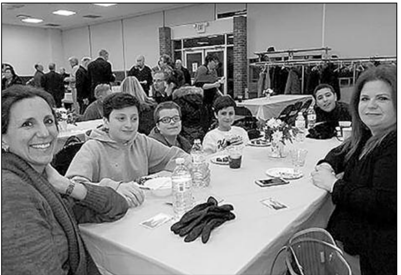
(above) Attendees enjoy the company of fellow Perpetual Adoration Adorers during the Anniversary Celebration of the Feast of Our Lady of Lourdes and the Adoration Chapel to be held on February 11, 2017.

All are invited to join us in celebrating this milestone! OLL is located at 300 Central Ave., Mountainside, NJ (908-232-1162).