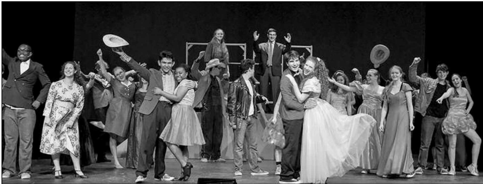
(above) The cast of CDC Theatre 2016 Young Artist Program production of Footloose

Looking to BUY or SELL your home With a local expert?