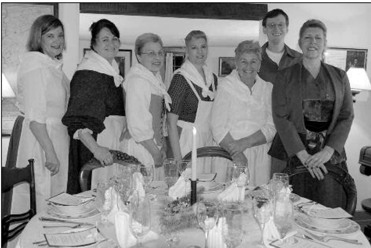
(above) Costumed members of the Mountainside Historic Committee prepare for last year's Colonial dinner at the Hetfield House. This year, on February 24th, the Hetfield House will host a Downton Abbey inspired dinner evening featuring an authentic Edwardian 5-course meal served by costumed volunteers.

Borough of Mountainside whose purpose is to restore and maintain the Deacon Andrew Hetfield House and the Levi Cory House and collect and save historic information and items from destruction. To make a reservation, for information or to donate funds, please call (908)789-9420; or, go to: www.mountainsidehistory.org