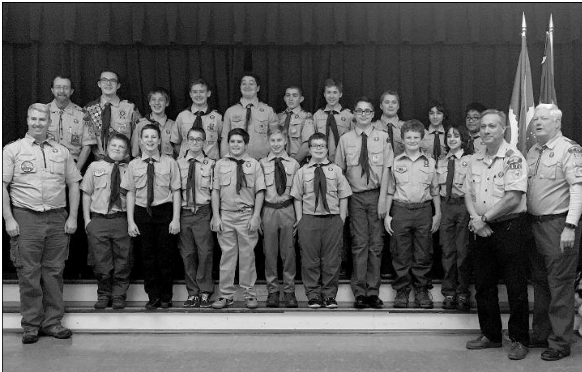
(above) Mountainside Boy Scout Troop 177 recently held their Court of Honor at the Community Presbyterian Church and awarded 48 merit badges and 26 rank advancements.