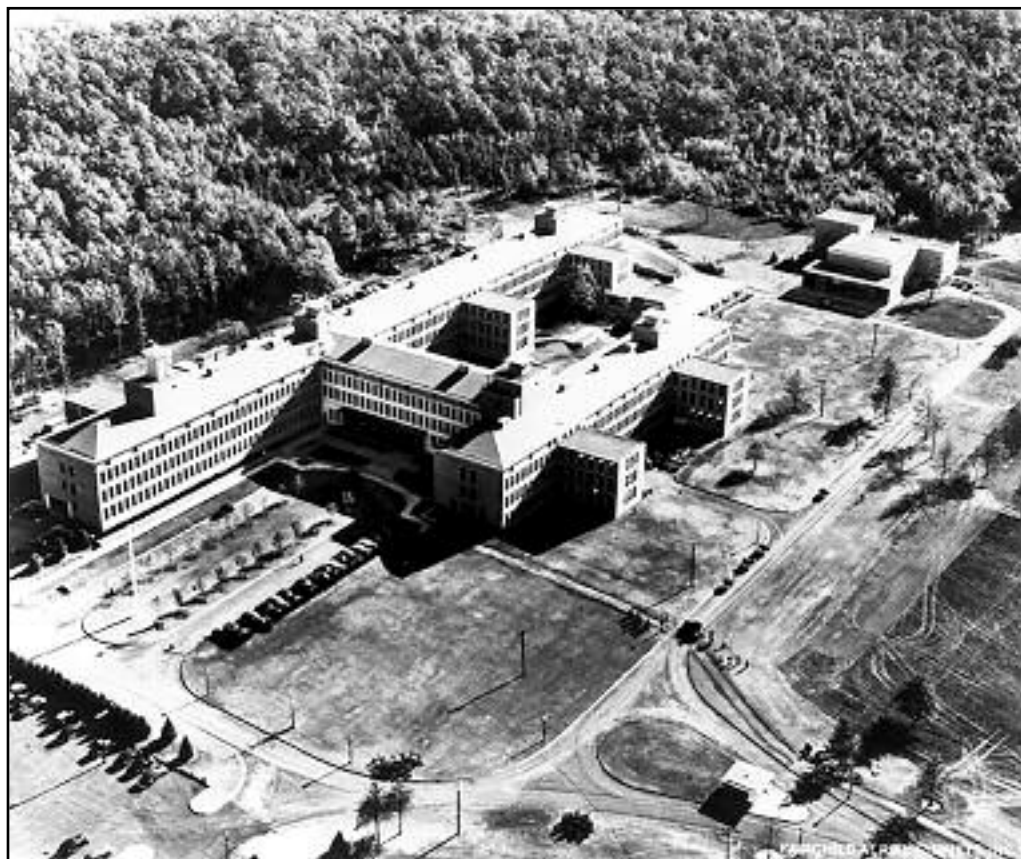
(above) Bell Labs