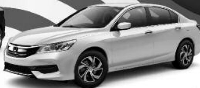
★ NEW 2017 Honda Accord LX

Auto, 4 cyl, p/opts. Stk#170470 MSRP:$19,540. $1,669 due at signing. $0 security. Residual: $13,851.25. 10k mi/yr; 15c thereafter. $995 Cap Cost Reduction. *$500 Military Appreciation Offer. *$500 College Graduate Offer.