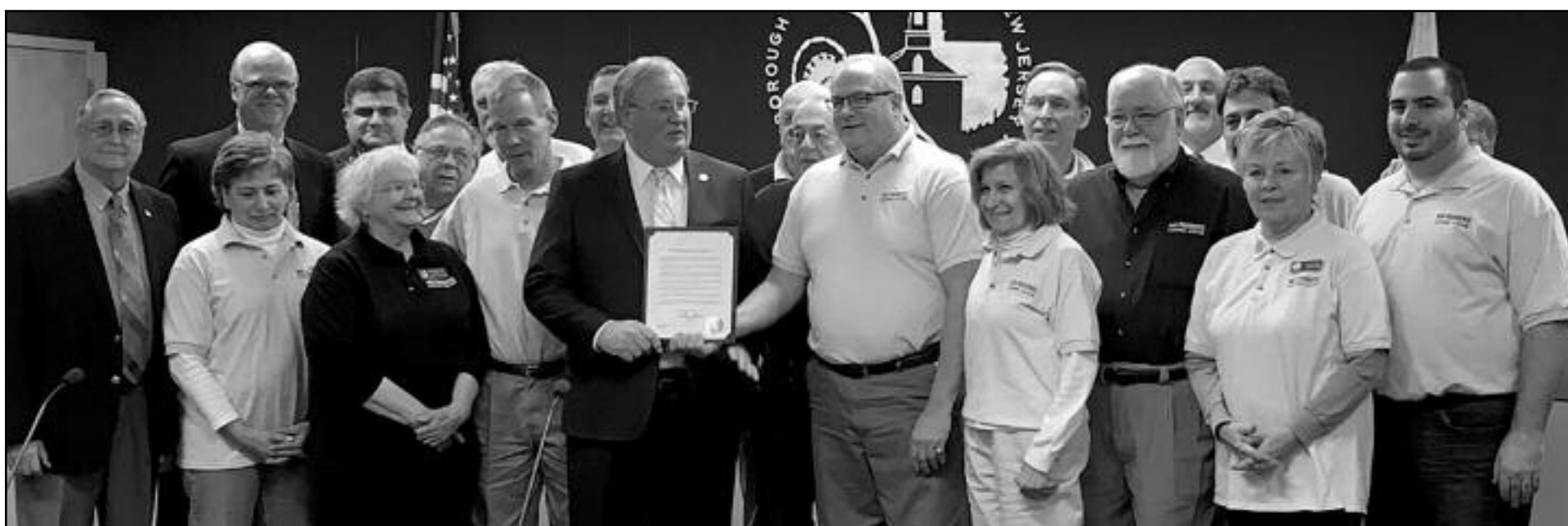
(above) During the New Providence Council Meeting held on January 23rd, 2017, Mayor Al Morgan read a proclamation commending the New Providence Lions Club

The New Providence Lions Club is a 501c(3) corporation and donations are tax deductible. For more information please email info@nplions.org .