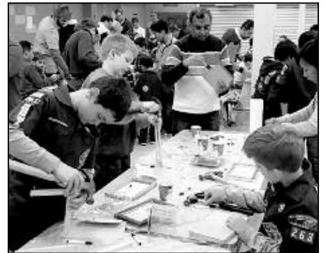
(above) Cub Scouts and parents spent evening building and painting toys and decorations to donate throughout the community.

These young scouts have embodied the spirit of community service and caring for others with their efforts. They show that, while scouting is definitely about the fun of camping and friendship, the greater gifts of giving and service have far-reaching and long-lasting effects on both the boys who participate and the community as a whole.