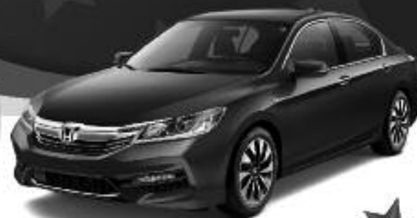
★ NEW 2017 Honda Accord Hybrid

Auto, 4 cyl, p/opts. Stk#170519 MSRP:$23,155. $1,699 due at signing. $0 security. Residual: $14,533.90. 10k mi/yr; 15c thereafter. $995 Cap Cost Reduction. *$500 Military Appreciation Offer. *$500 College Graduate Offer.