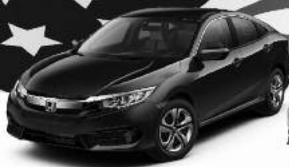
★ NEW 2017 Honda Civic LX