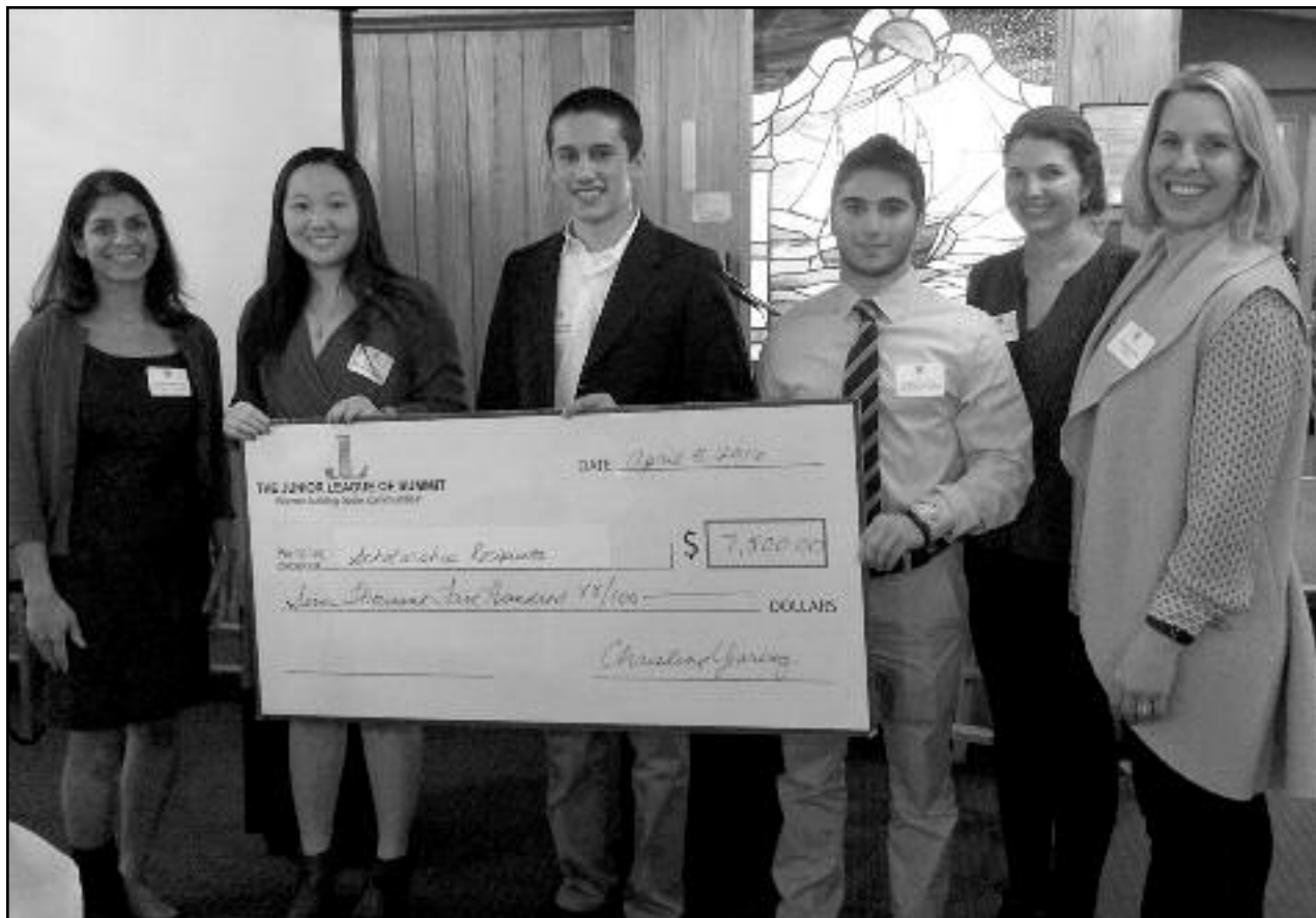
Congratulations to the Last Year's JLS Scholarship Winners.