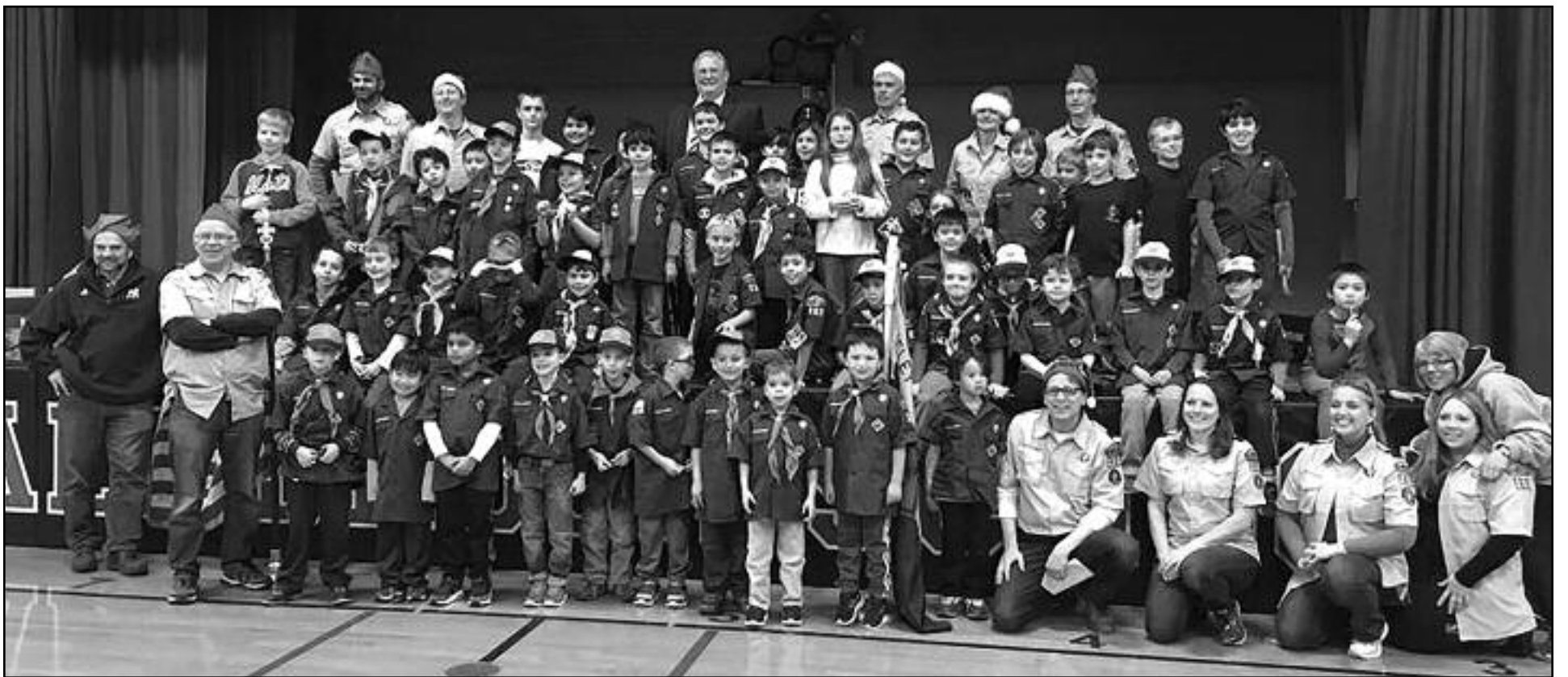
(above) Cub Scout Pack 263 with Mayor Al Morgan before their toy building pack meeting