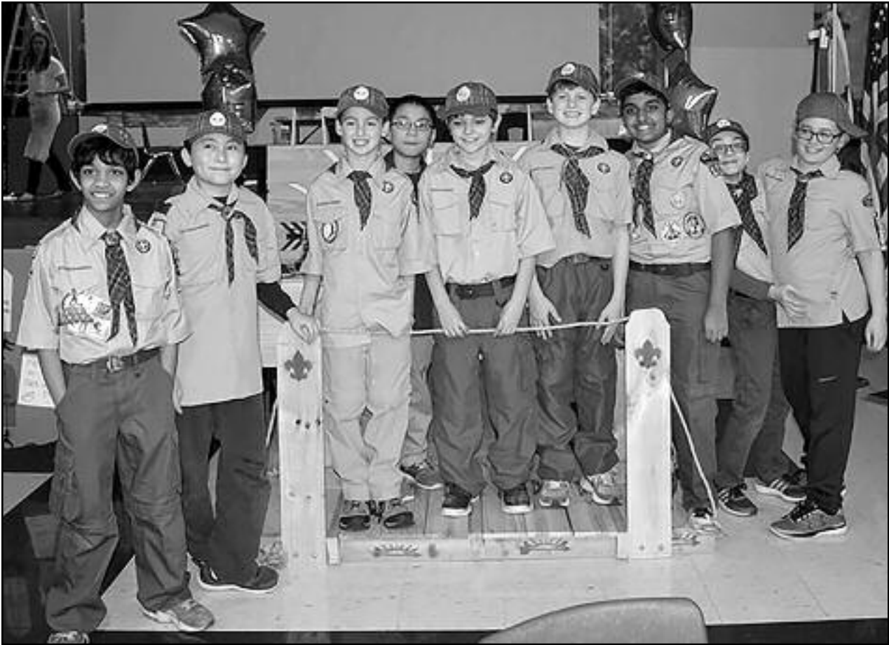
(above) Bridging of Webelo Arrow of Light recipients from Cub Scouts to Boy Scouts.